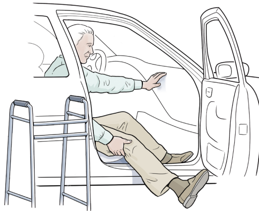
Figure 2. Lifting your legs