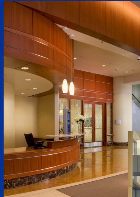
Chicago Maternity Obstetrical Triage Unit

Patients also enjoy flat screen televisions with comfortable seating.